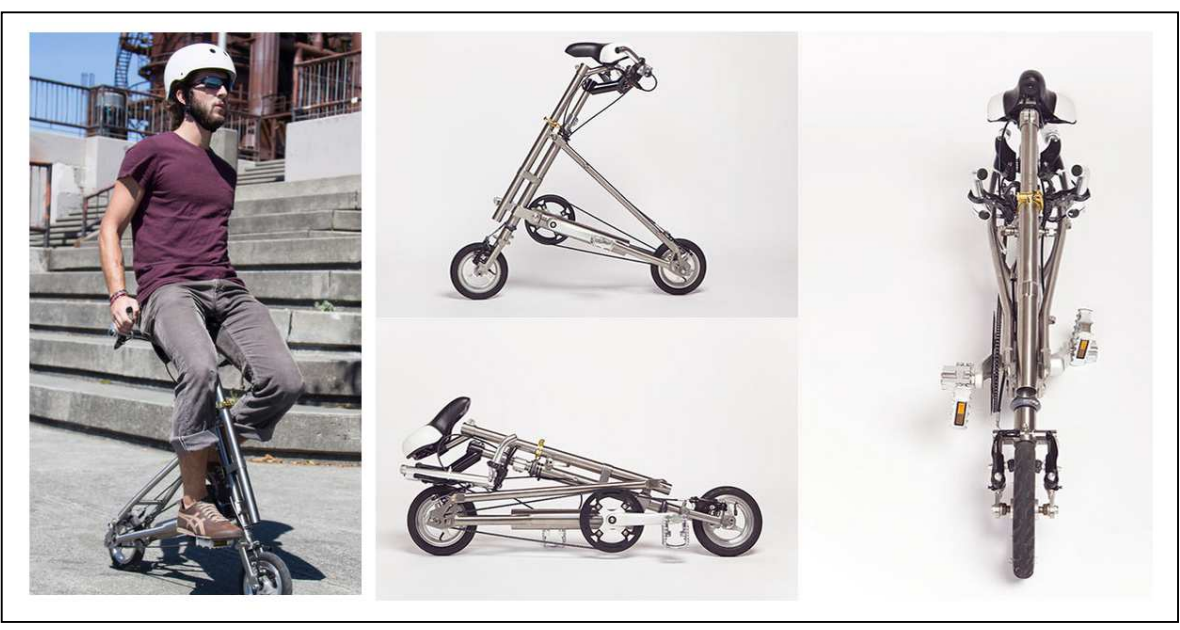
"Burke 8" Titanium Folder with 8" wheels

Folding bikes and trikes come in all sorts of interesting shapes and sizes and I occasionally buy cheap, interesting ones from ebay and follow up links in blog posts. So from Biking in a Big City comes this one, a folding Titanium mini-cycle with 8" wheels, in the Velocino style. There are other bikes in the Burke range but the Burke 8 is the smallest, lightest at 8kg, and quickest to fold. The Burke 20 has 20" wheels, takes longer to fold and is larger but the advertised weight is still only 8kg. The website (https://seattle-cycles.squarespace.com) doesn't currently include availability or pricing. You could bet $$$ not cheap but the larger bikes in particular seem promising and very light.