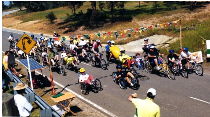
Start of the road race.

were very kind this year again supporting the event and donating a significant sum of money towards the running of the Challenge and we thank them very much.