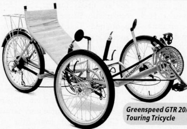
Greenspeed GTR 20/20 Touring Tricycle