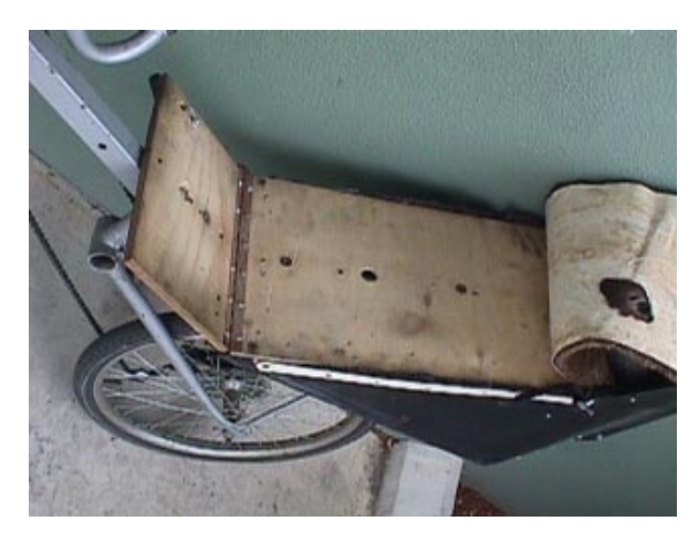
Steve Nurse's homebuilt plywood seat

attachement points. Several layers of different densities of foam adorn the curved base, and a durable cloth over the top holds it all together. These fine pieces of engineering are available for purchase from their Australian importer. The BikeE origninal seat is US$295, the new sweet seat is US$390, and the seat cushions are US$78. Iimagine the RANS seats will be similarly priced. When freight is added and the currency convert to Australian dollars, these prices don't seem to be very