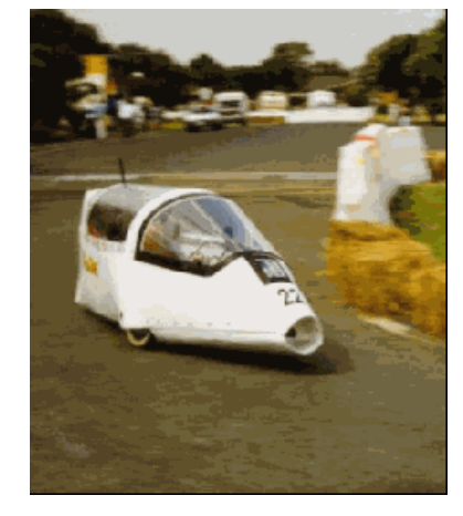
Trisled Team Machine

This is a race over 6 hours for individuals or teams as a relay. Competitors may ride any form of road going HPV, eg upright or recumbent bicycle or tricycle or tandem, or triplet etc...... Held in Canberra again this year - this is a good chance to see some