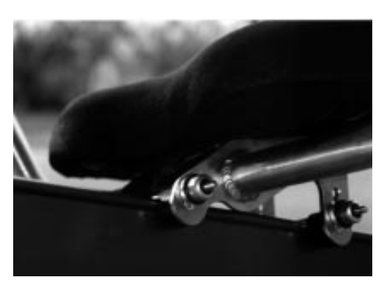
Close up from front and below of BikeE seat

exposed coathanger wire. Tension up the mesh with 3 mm nylon cord.Greenspeed uses eylets to thread the cord through, but you need the proper big eyelet stamping tool to do this. Small cheap eyelets just fall out (I tried). Attach the seat to the bike any way you can. Your bike design will determine whether you wish to use an adjustable seat instead of an