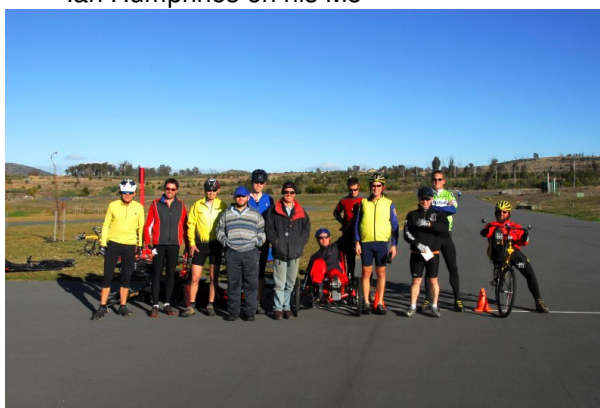
A happy Mob