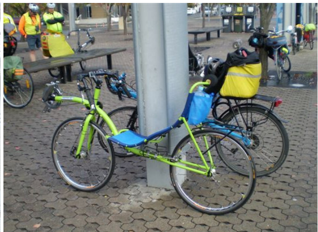
A Kustom Kotzur