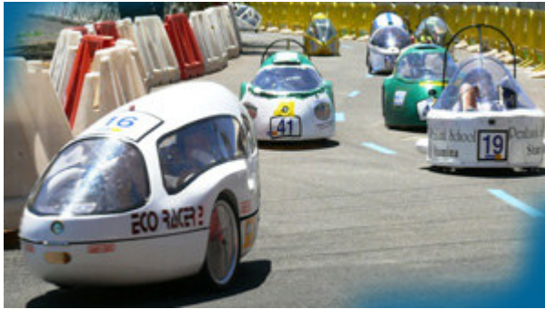
Energy Breakthrough Vehicles