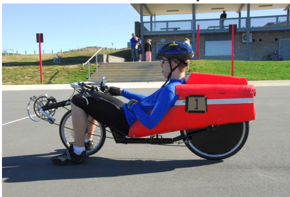
M@ Heal – ready for a lap