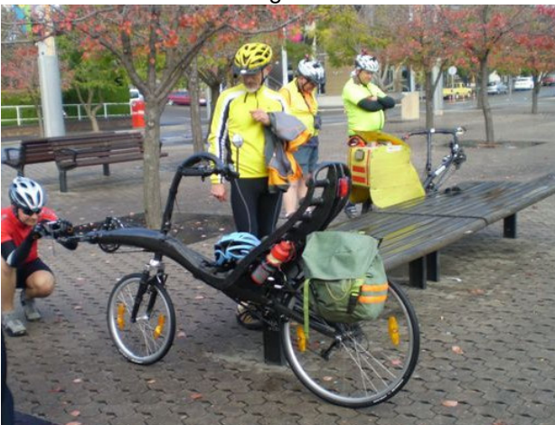
A home built carbon SWB