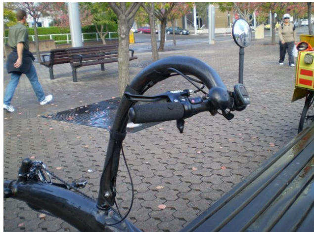
With an interesting handlebar arrangement