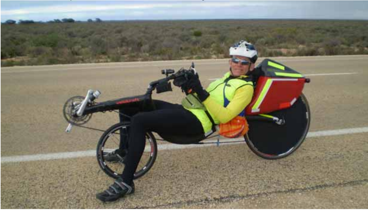
For the ride I'd decided my Velokraft VK2 was probably the most suitable considering all the issues and that turned out to be the case. Other options of different bikes, bigger tail boxes etc, might have

Well, I did that between the 26<sup>th</sup> July and 6<sup>th</sup> August this year and had a great ride, achieving all the goals I'd set and putting up a high benchmark for anyone coming along behind me trying to better the record of 11 days 17 hours for the 4,000km crossing between Fremantle WA and Bondi NSW.