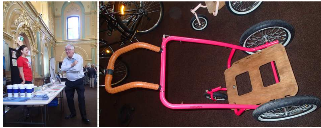
Friendly Bike Bendigo staff and the KKDU Plum trailer