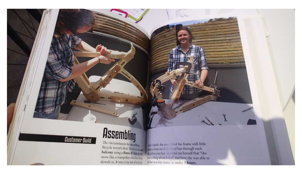
Part of Lewis' book documenting the kit bike